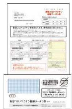
Sample vaccination coupon & envelope

Reception + Checking of Pre-Vaccination Health Screening Form by medical staff